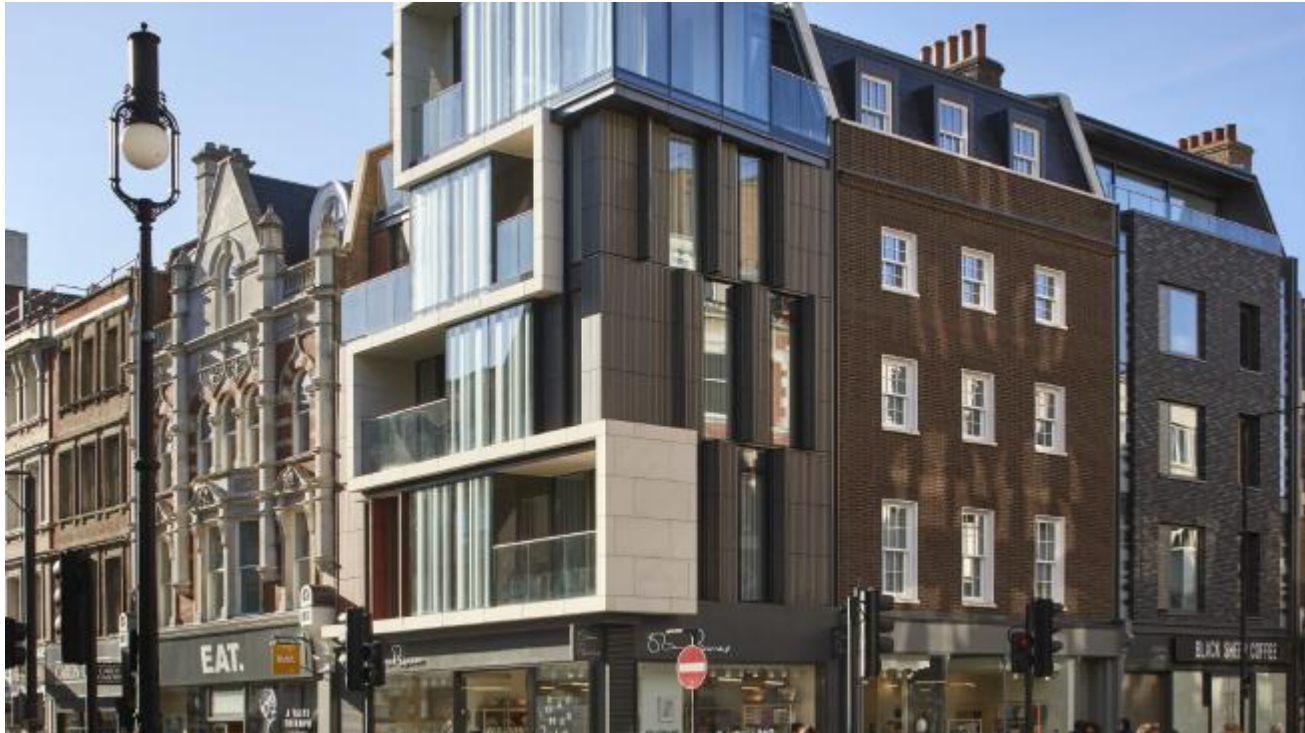
Artisan apartment development in London, for sale through Dukelease.

With just 13 apartments on offer, the ultra-exclusive Artisan development is in a landmark Fitzrovia location, on the corner of Tottenham Court and Goodge roads, close to the West End, Soho and Regent's Park.