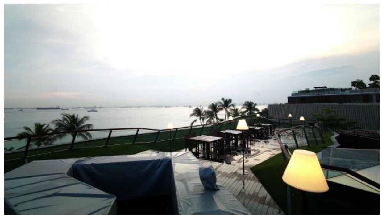
The Copper House Singapore is for sale with Christie's Real Estate.

Marketed through Christie's, it has six ensuite bedrooms, all with direct access to the pool, a 2000-bottle wine cellar with stainless steel cladding and triple-layer heated glass to prevent condensation, basement parking for eight cars, and a lift designed to look like a cut gem.