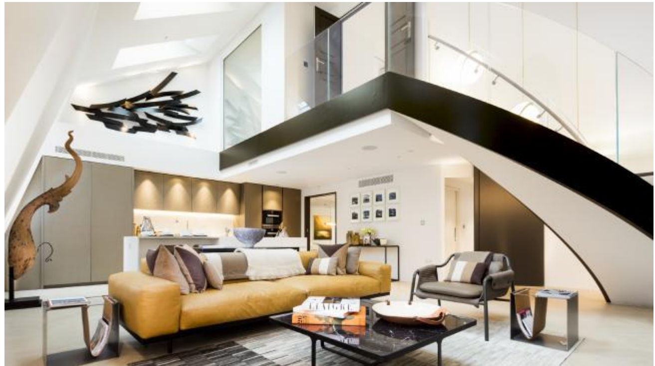
Artisan apartment development in London, for sale through Dukelease.

Features include timber chevron flooring, Italian-designed kitchens, and thoughtful, innovative layouts to ensure functionality. Floor-to-ceiling windows allow for natural light, plus the opportunity to survey the bustling city.