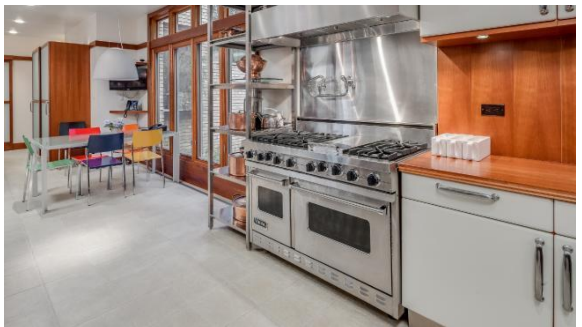
Dream Homes: A Princeton, New Jersey home on the market through Christie's Real Estate.

Wood finishes throughout include flooring and fireplaces, with wide windows for plenty of natural light.