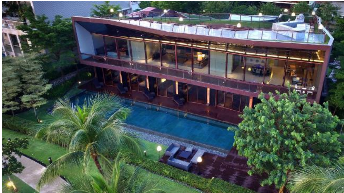
The Copper House Singapore is for sale with Christie's Real Estate.

Dubbed 'The Copper House' for obvious (reddish, metallic) reasons and set on 1672sqm, the home has a 40m ocean frontage on the Singaporean island of Sentosa.