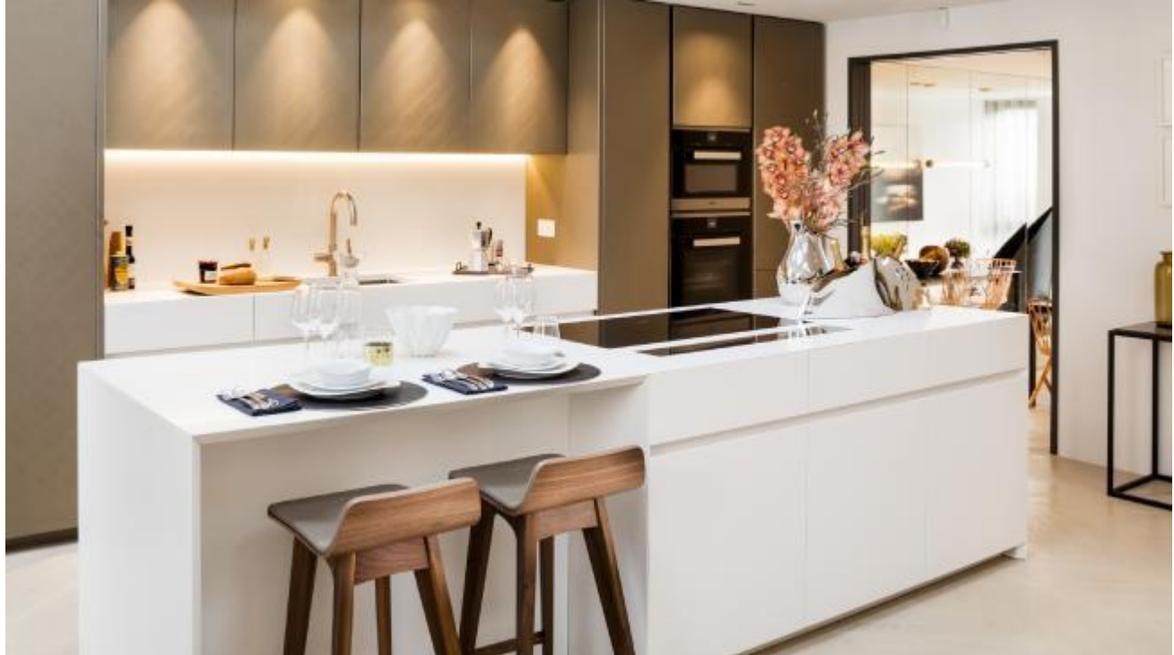
Artisan apartment development in London, for sale through Dukelease.

Features include timber chevron flooring, Italian-designed kitchens, and thoughtful, innovative layouts to ensure functionality. Floor-to-ceiling windows allow for natural light, plus the opportunity to survey the bustling city.